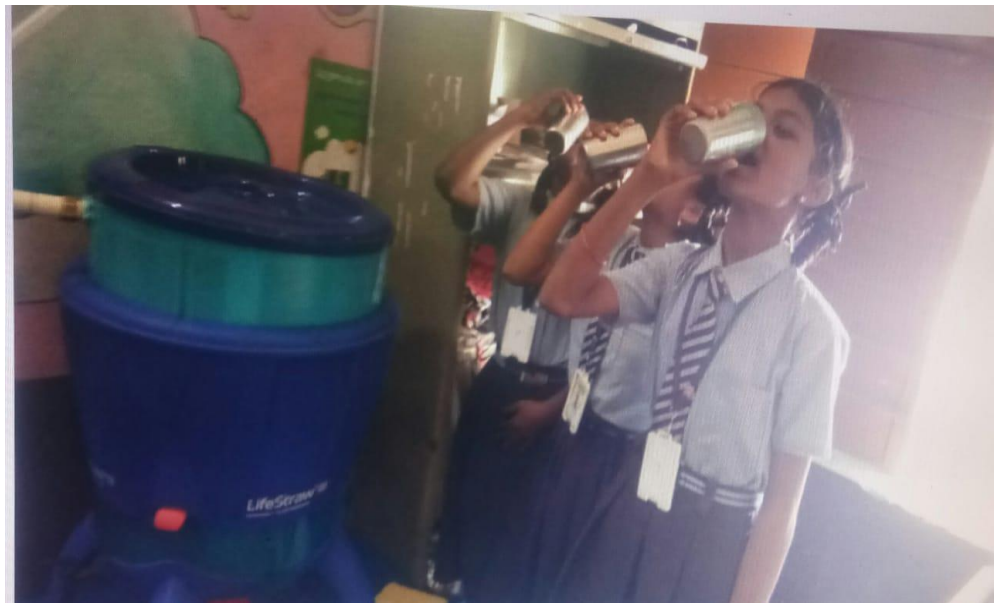
Photograph: 2 – Mallapur (MPPS) school students gaining access to safe and clean drinking water through Lifesraw water filters installations in Mallapur (MPPS) school.