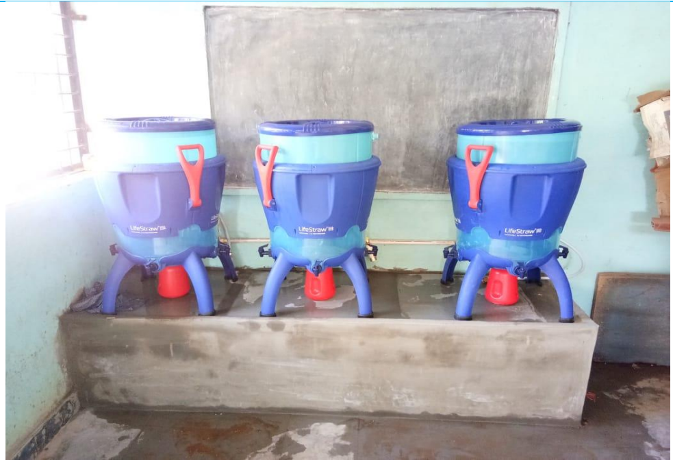
Photograph: 1 – Lifesraw water filters installations in Mallapur (MPPS) school.