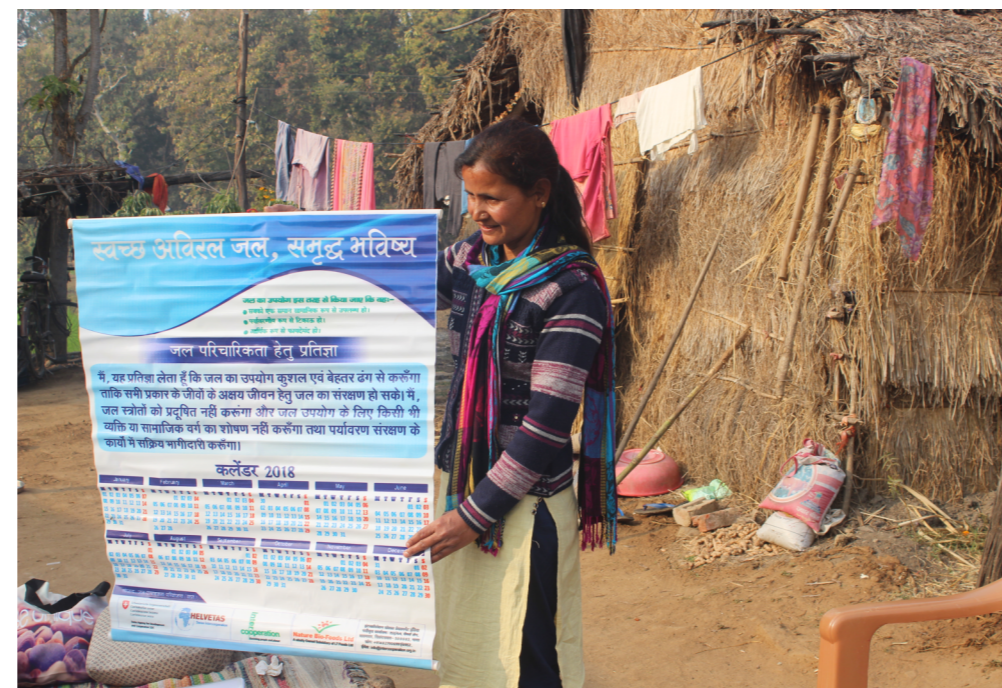
The Water Pledge

WAPRO has developed a Water Pledge that brings the community together under the common umbrella of water conservation and sustainable use. WEGs and schools are provided with yearly calendars that has the pledge written on it.