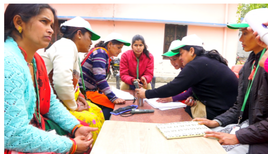
The Jalsakhi Training

Jalsakhis: A unique and successful concept where women farmers from project areas are identified based on their interest and commitment towards project goals. They are trained on project components and on community capacity building approaches. Jalsakhi's bring in a strong women's presence and their acceptance as a knowledge repository on water management issues is creating a wave change, encouraging other women farmers to participate actively within the project.