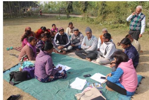
WEG Meeting in Progress

WEG Structure: WEG is an important decision making and support body at the local level, that gives space for the community to voice concerns related to water access and management. They are able to plan and execute corrective measures, collectively.