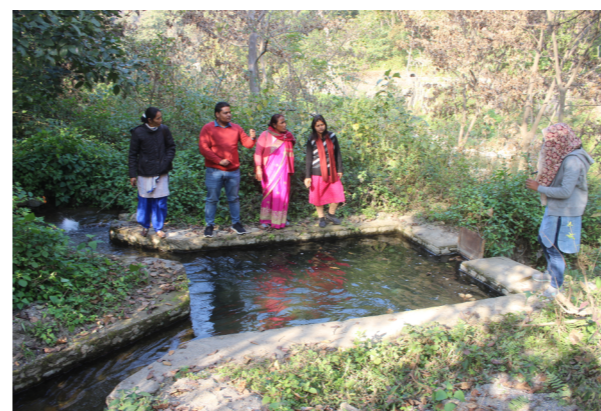
Desilting Tank, Kiari Gaon

a) Desilting tank construction: Drinking water to Kiari Gaon originates from springs located 2 kms from the village and flows through the canal to the village carrying silt and decaying organic matter rendering water non-palatable.