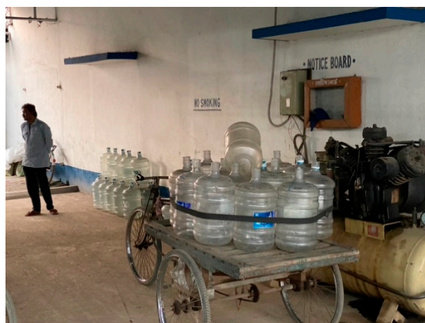
Figure 7. A water-vendor collecting jars at the licensed RO-plant.

In Badai, there are three different sources of drinking water: some households still rely on the traditional hand pumps, others get their water from public stand posts and some buy RO water. A large, government certified bottling plant sells 20-L jars, which are delivered by small, informal vendors, who buy the water from the plant and earn their living from the delivery (Figure 7). Piped water is provided to the stand posts by the Public Health Engineering Department of the West Bengal Government. Untreated groundwater is available here three times a day for one and a half hours. Especially in the summer months respondents reported shortages of domestic water, mainly for those who rely on their own hand pumps, because of ground water depletion.