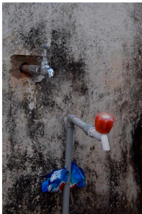
Figure 4. Two parallel supply systems—two water taps per household.

The water supply to households was in a transformative stage during our visit. Under the "Mission Bhagiratha" Telangana state aims at providing 100 L of piped treated drinking water to households in rural areas [118]. In March 2019, the pipelines were being laid in the village, but there was no water in the pipes yet. Thus, the population was still relying on the supply from the gram panchayat, sourced from the local tank. Each household got two hours of water supply on every second day. The water has to be stored by each household individually, so one finds plastic barrels and other storage facilities in front of almost every house. Parallel to that, there is a drinking water supply, delivering treated water from river Krishna to public standposts. Water is available here between one to two hours daily. Thus, for households two parallel water supply infrastructures are in place and a third is in the making (Figure 4).