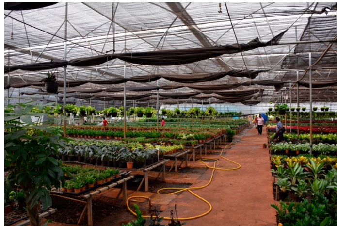
Figure 3. Nursery in Uruli Kanchan.

RO-plants now, are the main source of drinking water for most households in Uruli Kanchan. One NGO has facilitated the implementation of these RO plants, because of a high burden of gastrointestinal diseases. The NGO set up four RO plants, which will be handed over to the gram panchayat in future. For domestic water, each household has a tap connection outside the house, provided by the gram panchayat. Each household receives 50 L of domestic water per capita per day. The water stems from a dam in the Western Ghats, upstream of Pune. There are plans to install a filtration plant to supply piped high-quality drinking water to each household in future. Respondents from the local administration would like to see Uruli Kanchan to be upgraded to a municipality. This would mean an increase in funds, a change in the administrative structure and consequently an increase of services for the citizens, e.g., regarding the provision of water.