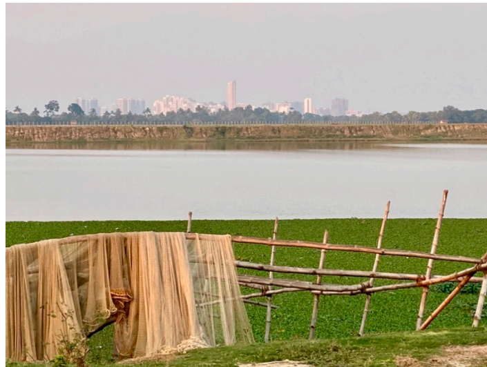
Figure 6. View of the largest tank of the fishing co-operative with a vista of Newtown, a satellite city of Kolkata.

domestic purposes. For drinking water most villagers rely on RO water, which is delivered by local water vendors.