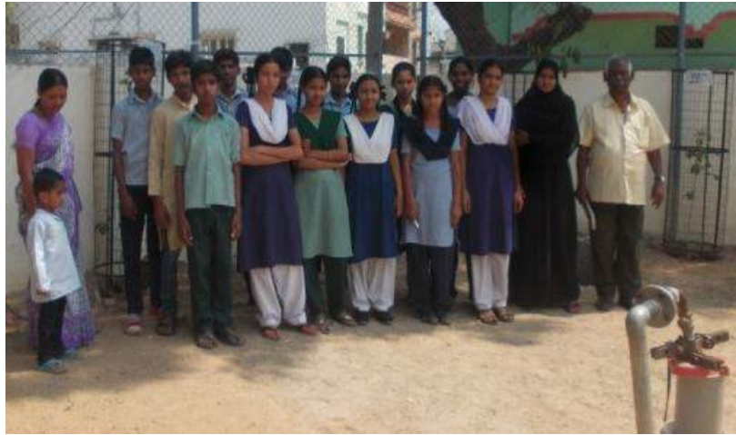
The school advocacy team of the Government school, Rasoolpura

The active School Sanitation Team formed by BVS has turned the situation around. The garbage dumps have been removed and the school compound has now become green zone with trees planted and garbage bins in place. BVM is now striving to make it into a model school by getting regular water supply and functional toilets. However, the process with the government is very slow, even in the provision of basic services to school.