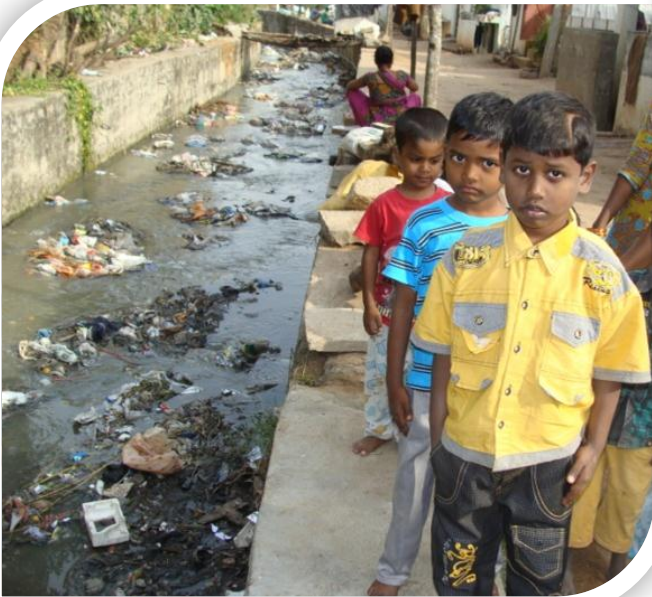
Before project intervention (1/3/2014)

The BVM realised its strength as a “community” for the first time when the local community hall, which was under the exclusive control of the local leaders and the economically powerful group, was released from their control and put at the disposal of the more democratic collective