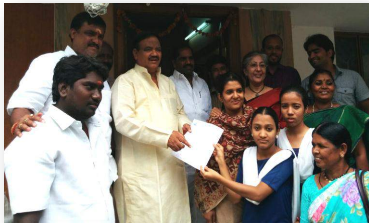
Member of the school sanitation team submitting representation to the local elected representative for provision of water in schools

A recent successful effort of BVM was the revival of the School management committee which was defunct. "Get Involved" an advocacy campaign was initiated by BVM Rasoolpura, on Children's Day in the Government School, Rasoolpura. The Student's Management Committee (SMC) of the school, the Headmaster and