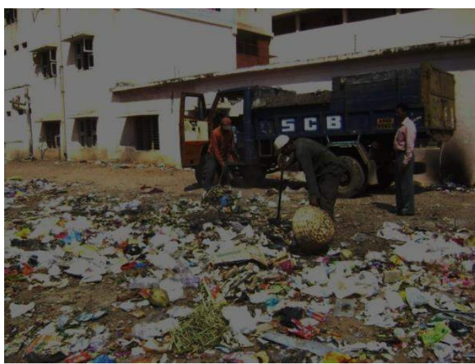
Before the advocacy