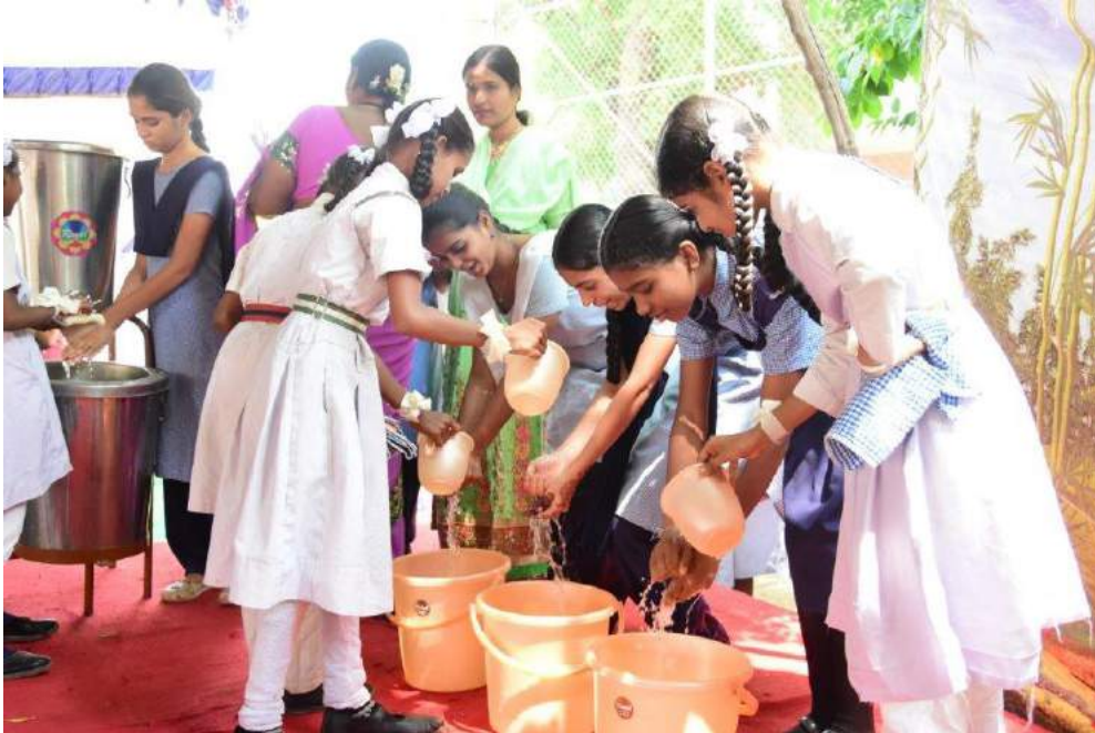
Children demonstrating hand washing lessons on Global Hand Washing Day