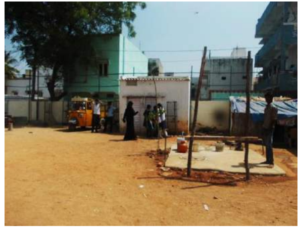
After the advocacy

School sanitation and hygiene is an essential component of the Total Sanitation Campaign, which includes provision of toilet infrastructure and hand washing facilities in schools and hygiene education, to promote behavioural change amongst children.. The government schools in slums are again a victim of negligence in terms of provision of basic rights. Hence Basthi Vikas Manch -