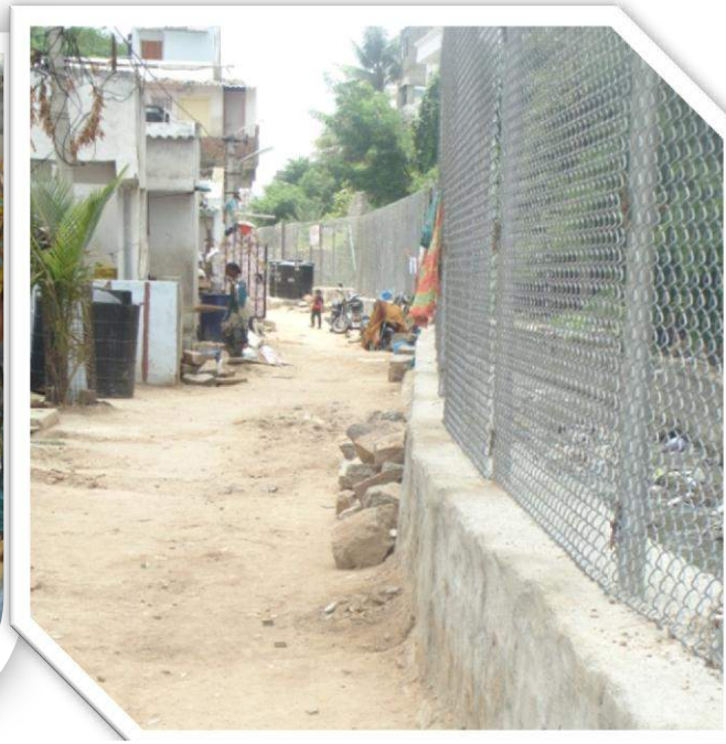
After the intervention (1/8/2014)

group. Followed by this, was the demand for community bins which were placed in slum. With this, the number of members in BVM increased from four to 10 and gradually the community supported the BVM activities.